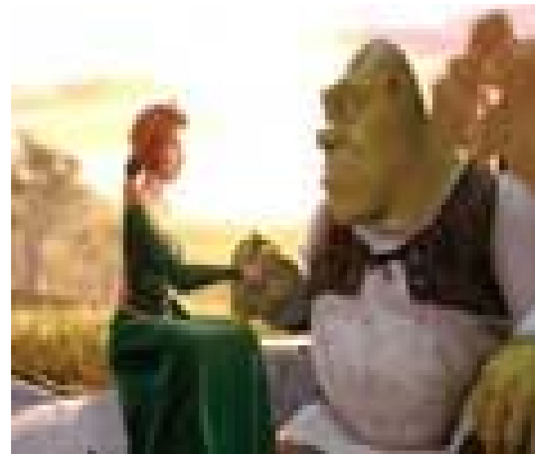
The orge, Shrek, and his love interest Princess Fiona.

"Shrek 2," welcomes back Mike Meyers (Shrek), Cameron Diaz (Princess Fiona), John Lithgow (Lord Farquaad), and Eddie Murphy (Donkey).